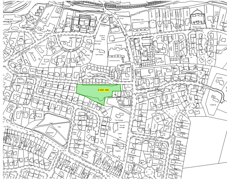
Figure 3: Porthrepta Car Park Site

an ideal brownfield site for community-led development, which would bring employment and amenity benefits to the surrounding area. The section of the car park that is regularly used for access to the Scout Hut must be retained. As the site is tightly surrounded by residential and other uses (see Fig 3), any development must be sensitive, of appropriate scale and involve the local residents at proposal stage – as is the case for all of the proposed sites.