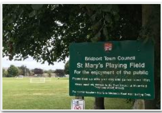
Follow Green Route beside St mary's Playing field until you reach the children's playground.