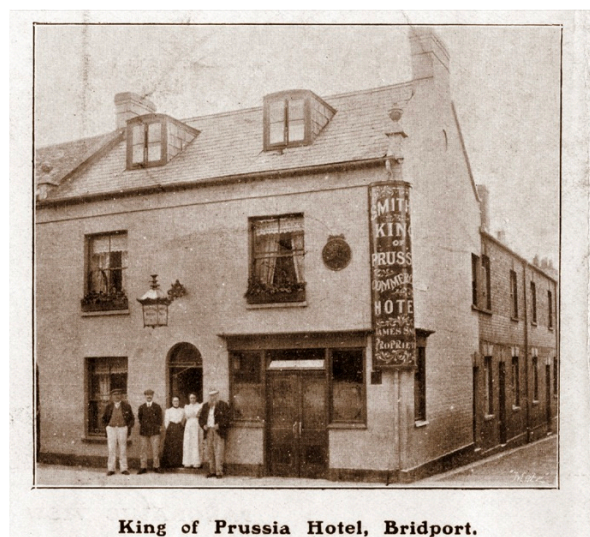
King of Prussia Hotel, Bridport.

15. What business currently occupies the site once the location of the Louis Trevett Hairdressing Salon?