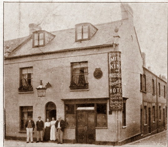
King of Prussia Hotel, Bridport.

Answer - 52 East Street and today it is the Lord Nelson licensed public house.