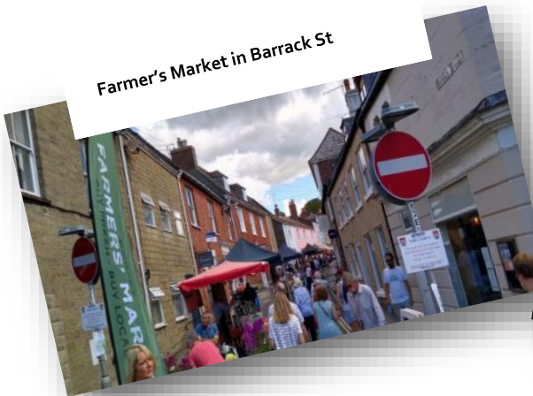
Farmer's Market in Barrack St