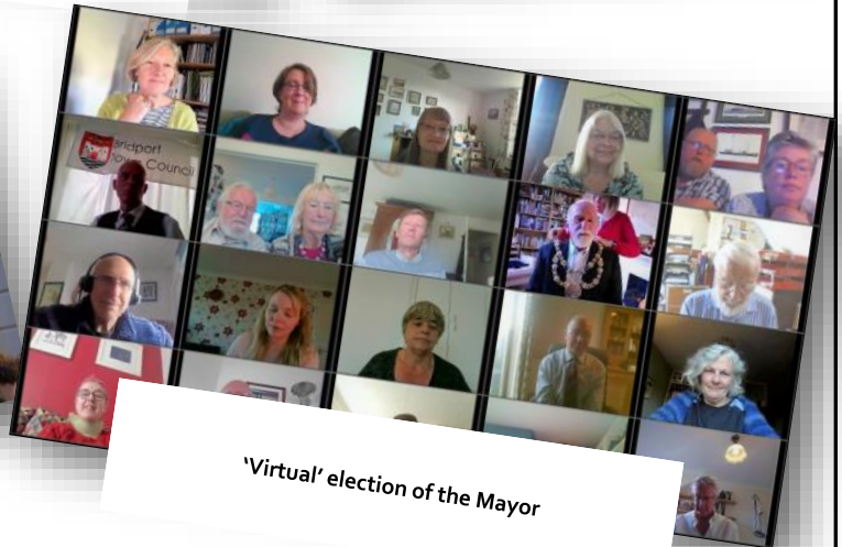
'Virtual' election of the Mayor