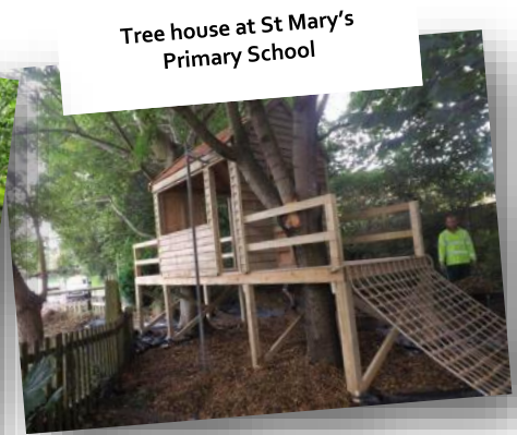
Tree house at St Mary's Primary School