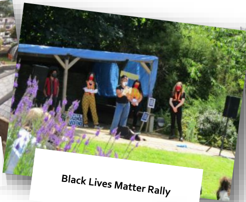
Black Lives Matter Rally