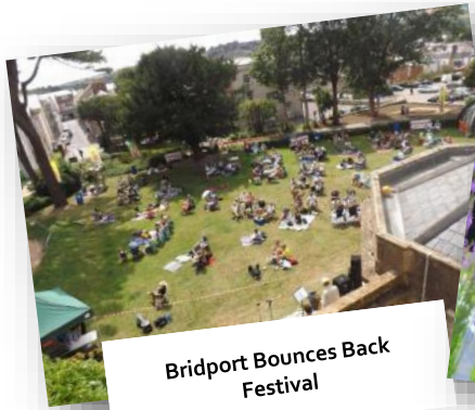
Bridport Bounces Back Festival