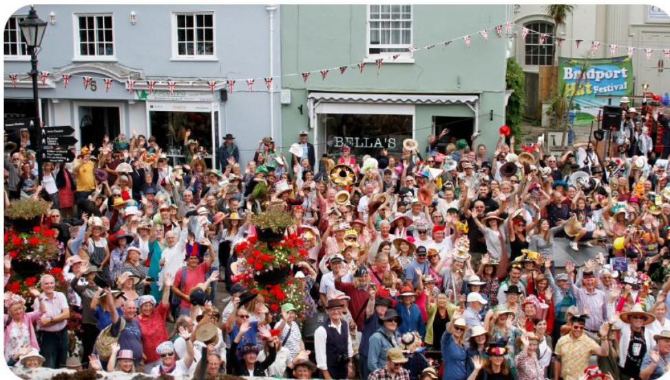
Bucky Doo Square during Bridport Hat Festival 2022

The creation of a unitary Dorset Council has created challenges for town and parish councils in the area, particularly in 'stepping up' as the now second tier of local government in their areas. Bridport Town Council, as one of the larger councils in Dorset, has responded positively to protect and enhance services in its area, such as the Tourist Information Centre and Community Bus Service.