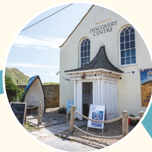
Photo credits: West Bay Discovery Centre: Jayne Jackson / Old harbour: English Heritage / Asker Meadows: Sarah Jane Ross